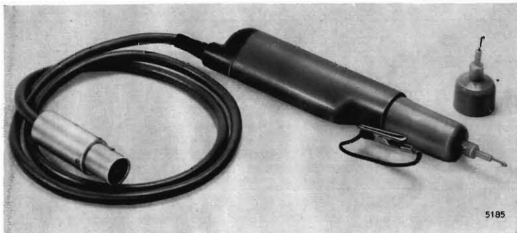
Cathode-follower probe GM 4603 D/00

The maximum permissible d.c. component on the blocking capacitors is 300 V