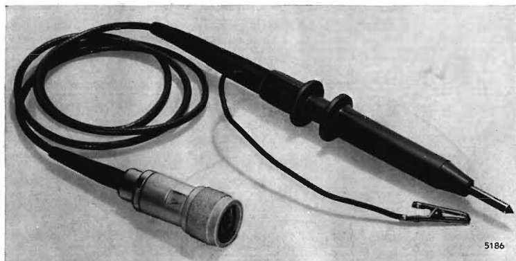
Attenuator probe GM 4601 A/10

(Used with the oscilloscope GM 5603) maximum 200 V p-p about earth level